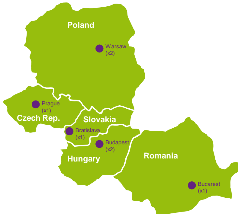
CE Colo Data center Locations in Central Europe